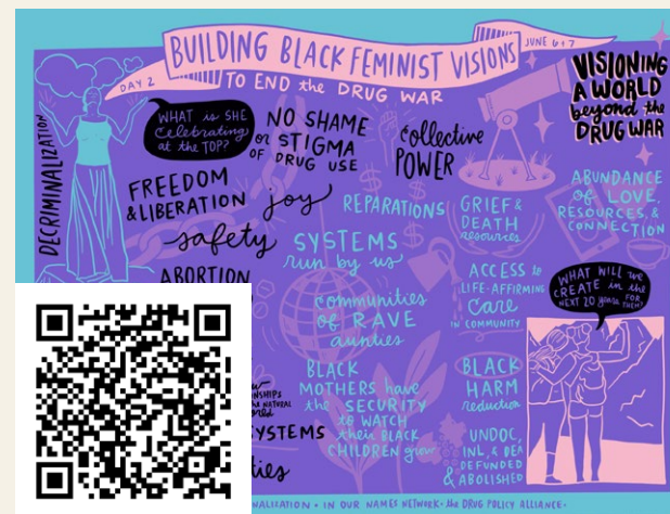
Explore Black Feminist Visions Graphic Notes

“We fight back against prohibition with solidarity, mutual support and leadership, building our networks from the grassroots to the global, from immediate action to long-term strategies to end this war on womxn who use drugs. We embrace intersectional and anti-prohibitionist feminism that integrates queer/trans-inclusive and non-ableist approaches, racial justice and the right to use drugs and experience pleasure. We work to reclaim our bodily sovereignty, including rights to the full range of sexual and reproductive health, gender-sensitive health services, and rights to use drugs. We do not ask for charity but for solidarity. We demand to live in safety and freedom.”